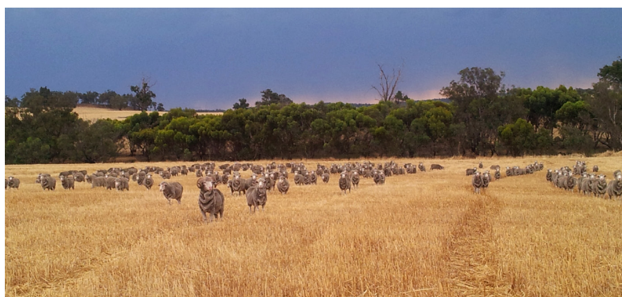
WA medium rainfall top 20% by return on equity