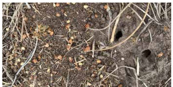
Ant predation of surface seed by stripping seed from burr to take down into nests

Choosing cultivars that best suit the soil type, grazing approach and time of flowering to match growing season length is critical to the long-term success of a sub-clover pasture. 3