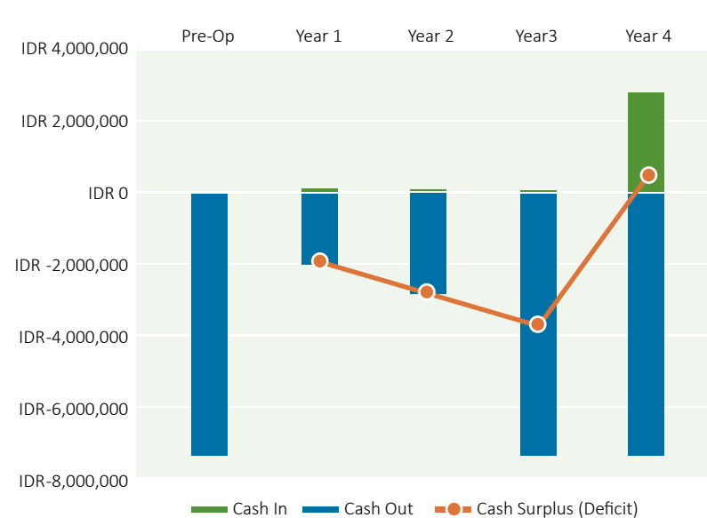
Figure 2. Cash Flow (in thousand IDR)

With a large number of grower bulls aged 24 months or older, the company will sell approximately 150 head in year 4. Part of the stock will be sold during the Qurban Festival, when cattle selling price is very high. Based on this strategy, the company is projected to generate a cash flow surplus of approximately IDR 450 million by the end of 2020 (4<sup>th</sup> year of production) (Figure 2).