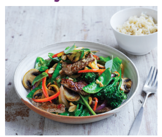
Slice 1 large rump steak into strips to make 2-3 meals