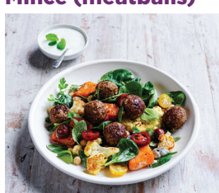
500g lean mince makes 4 meals