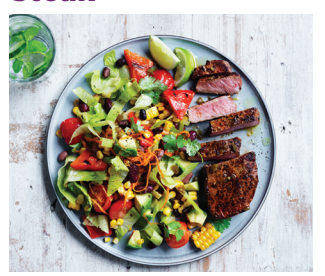
Use 1 small to medium steak per meal