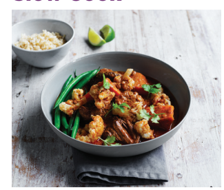
650g-1kg slow cook cuts or diced meat makes 5 meals