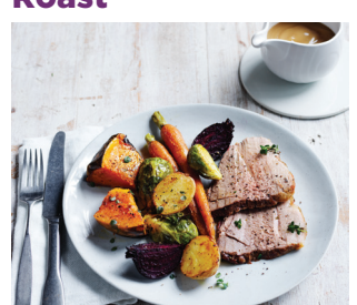
1kg roast makes 5 meals