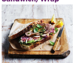
1 to 2 slices of leftover roast meat to make a sandwich