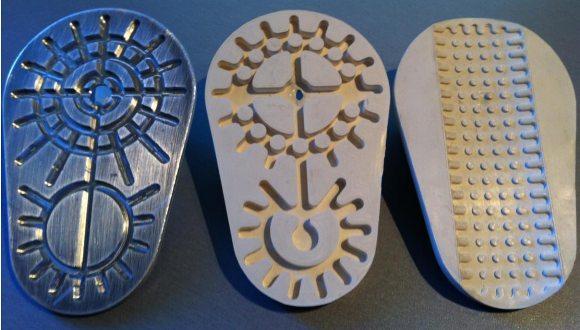
Figure 6.1 Examples of Vacuum pad evolution.