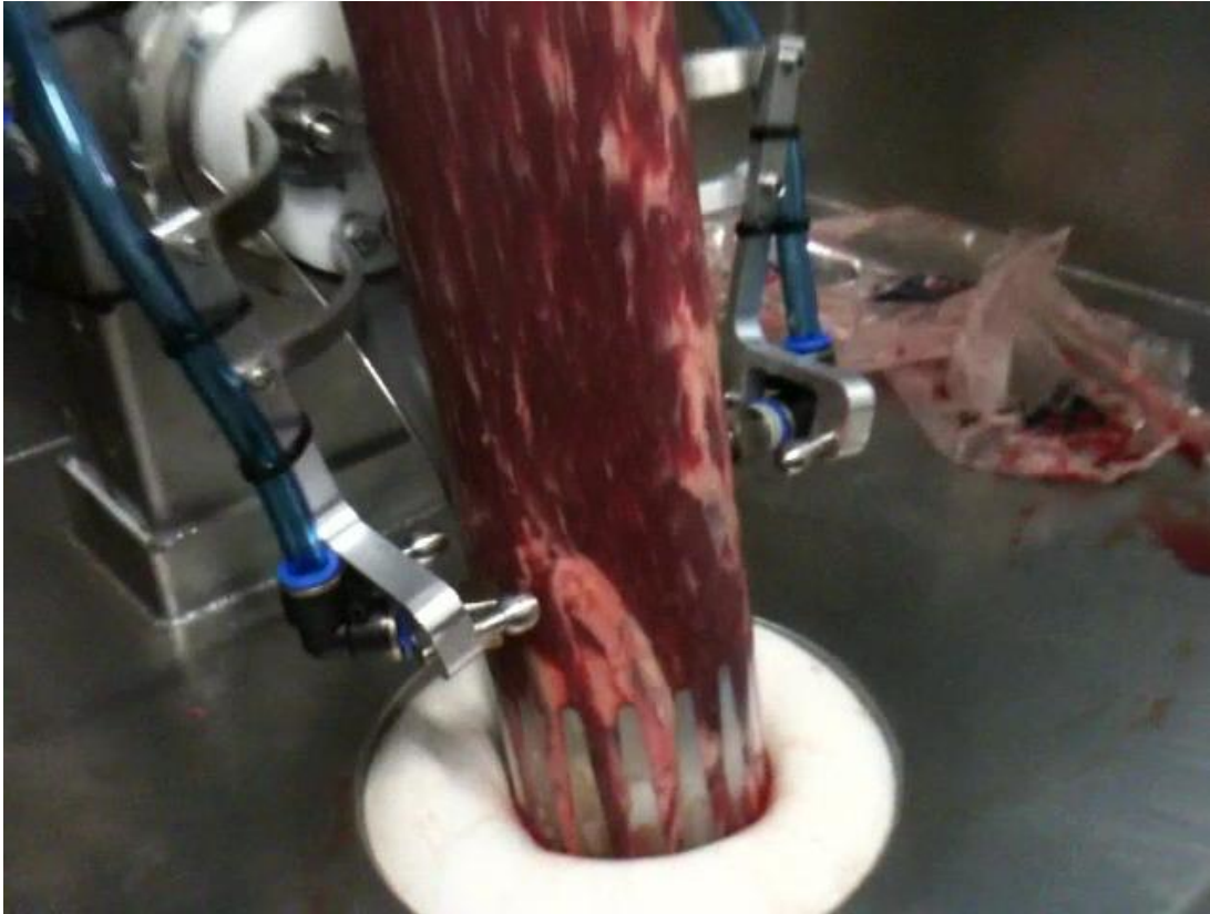
Figure 4.2 Example of finger-type bag holder holding meat and packaging film at conclusion of ejection cycle.

Retention during the ejection cycle was tested under normal operation in the modified MLA test jig (a minimalistic replica of the SmartShape machine chamber, used for testing of the rubbers for the SmartShape machine). Results showed that the fingers retain the packaging film under ejection load, and during this period did not cause the packaging film to fail at the points of contact.